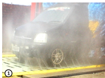
Under Chassis Wash